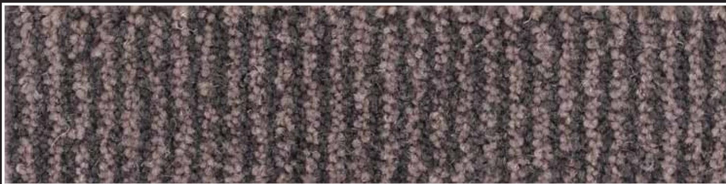
1 TO 1 GRANITE & COCOA