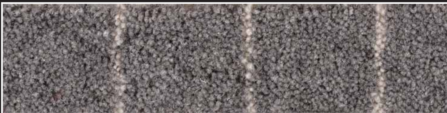
15 TO 1 EBONY & GYPSUM