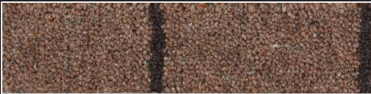
30 TO 2 CINNAMON & MAHOGANY